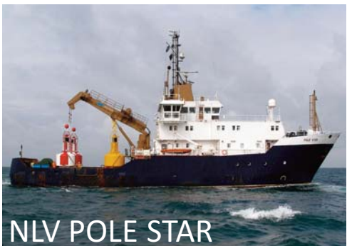
NLV POLE STAR