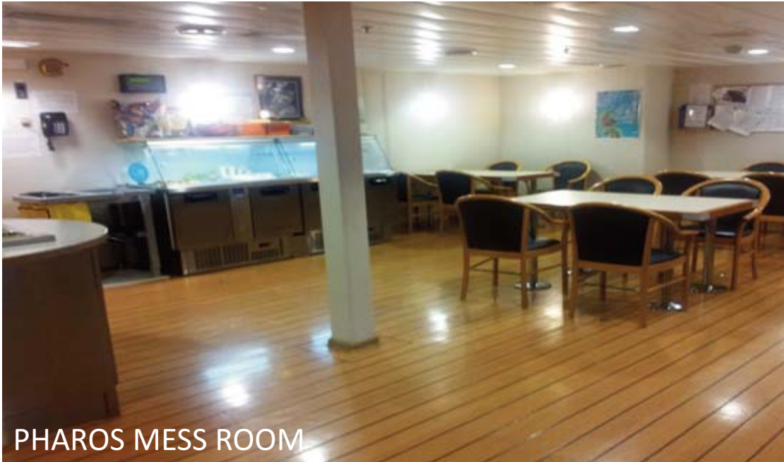
PHAROS MESS ROOM