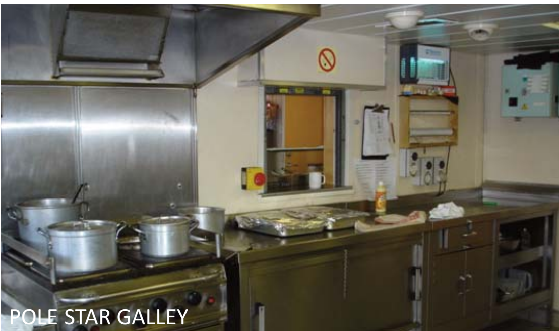
POLE STAR GALLEY