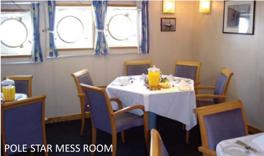
POLE STAR MESS ROOM