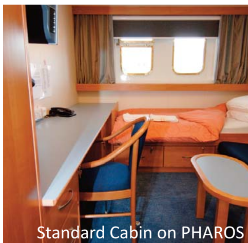
Standard Cabin on PHAROS